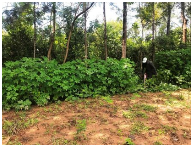
Cut Vetiver grass used for mulch

The home garden area where we practice ideas such as container planting and the keyhole garden has been reduced with the construction of the stoves training building. We however continue to show ideas that are particularly relevant for visitors from Kisumu town. This is partly a demonstration of what can be done on very small areas, emphasising ideas relevant for urban farming, but is also a useful source for the kitchen. Visitors often eat food from this garden cooked in our improved local kitchen. The external rural kitchen, which has been fitted out as an operational local kitchen using the fuel saving stoves, and other aspects of teaching included in the REAP extension teaching, has continued to be used and is always a focus on interest for many of our visitors. It is often the place where visitors are first welcomed.