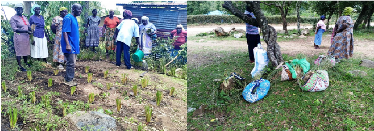
Vetiver Seminar in Upper Nyakach