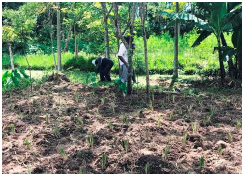
Replanting the Vetiver nursery after harvest

The rainfall has been reasonable, but unpredictable with much less seasonality than in the past. Although this is a challenge for many farmers, with the underground water available on farm and the location of the land we have continued to try a wide range of plants including some new to the area. Since the soil is fully protected against erosion the farm is a visible example of what farmers can do using the simple technology of Vetiver grass; this has continued to be a central part of the teaching that we are seeking to extend. To this end all the Vetiver hedges have been renovated and maintained giving a very good visual image on what Vetiver hedges actually achieve in different contexts within the farm. The Vetiver Nursery has continued to be a good source of planting material as we take the teaching out further afield. The whole nursery was harvested and the slips distributed and sold, and the whole area replanted so that more is available again. We have been able to plant some Vetiver grass at key points near the roads in the area.