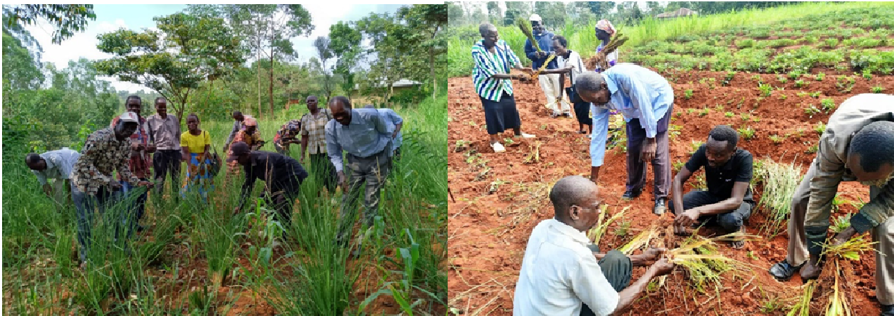
Vetiver Seminar in Butere

In June 2024 the team conducted a seminar for farmers involved in planting Vetiver grass in the Butere area with 27 participants and then a second seminar in March 2025 on Vetiver Grass in upper Nyakach, attended by 38 participants. All these farmers took home planting material and now have their on-farm Vetiver nurseries, and most have started protecting their land with Vetiver Grass hedges. REAP has also more recently been working with a new group in Seme on the western edge of Kisumu County.